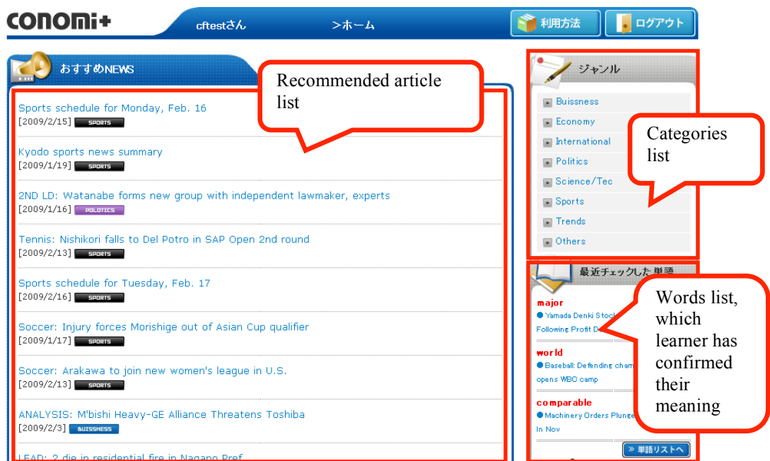
Figure. 2 Main screen